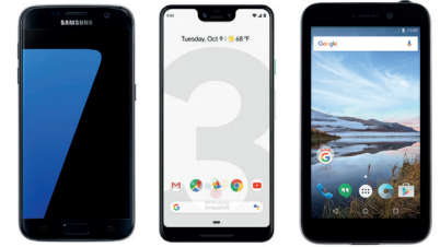
Samsung S7, Google Pixel, Bittium Tough